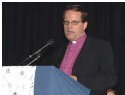
The Bishop of Middleton blesses the Academy