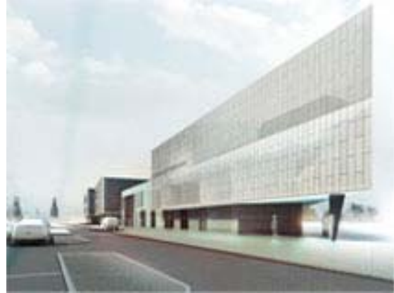
Myrtle Springs Academy