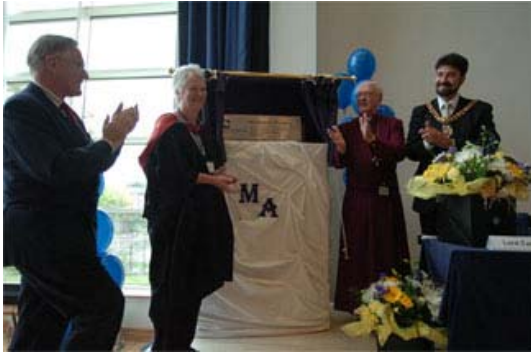
The Plaque is unveiled by Lord Carey

This extract from The Principal's Speech at the opening ceremony of Manchester Academy provides eloquent testimony to the changes that are underway: