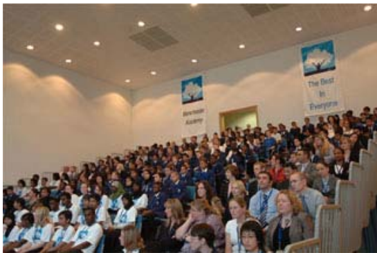
Students and staff of Manchester Academy