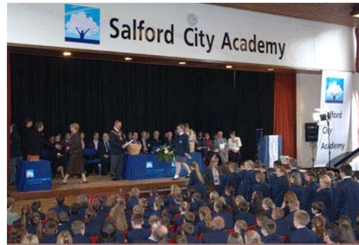
Foundation Certificate Ceremony

The ULT Governors were delighted to attend a special foundation ceremony to mark the beginning of Salford City Academy. The significance of this transition in status was marked by every student receiving a certificate, and the occasion was a celebration for all who are working so hard to make the Academy a success. We look forward to opening the new buildings next year.