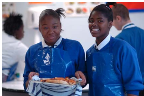
Food Technology students