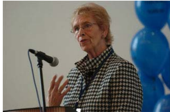
Dame Angela Rumbold addresses the students on 'reaching for the top'